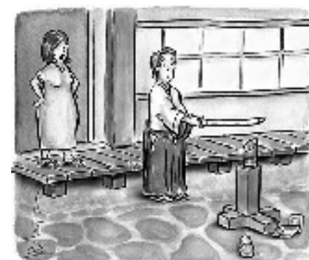
"I think about the kata and what it means to me every day."